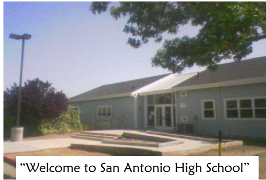
"Welcome to San Antonio High School"

San Antonio High School opened in 1966, with the promise of providing a smaller setting, individualized instruction, and an alternative pathway to graduation for students sixteen or older at risk of failing in the comprehensive setting. San Antonio's curriculum meets California State Standards and all Petaluma City Schools graduation requirements while focusing on the various learning styles and the needs of students. In addition, San Antonio houses a very successful teen parent program that provides for the academic and health needs of students 14 and over and their children before and after giving birth. Services include prenatal care and daycare while students attend classes.